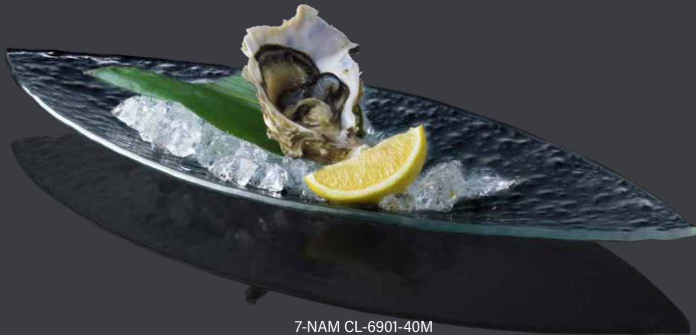
7-NAM CL-6901-40M glass leaf plate clear Glasplatte „Blatt“ 40 x 15 cm