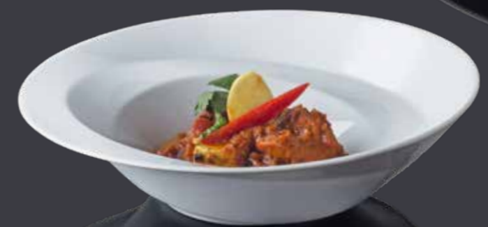
NAM1423 bowl / Schüssel 23 cm