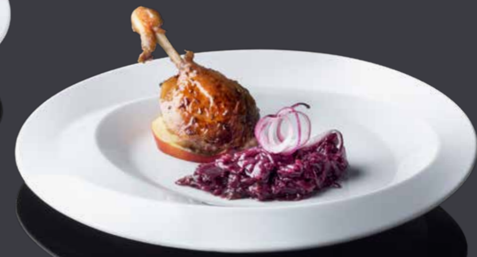
NAM2127 flat plate / Teller flach 27 cm