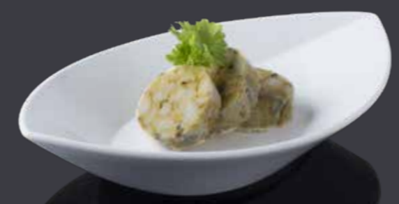
NAM1626 side dish / Schüssel 26 x 15 cm