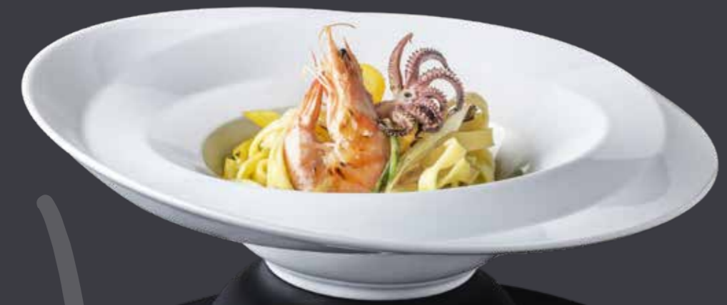
NAM1927 pasta plate / Pastateller 27 cm