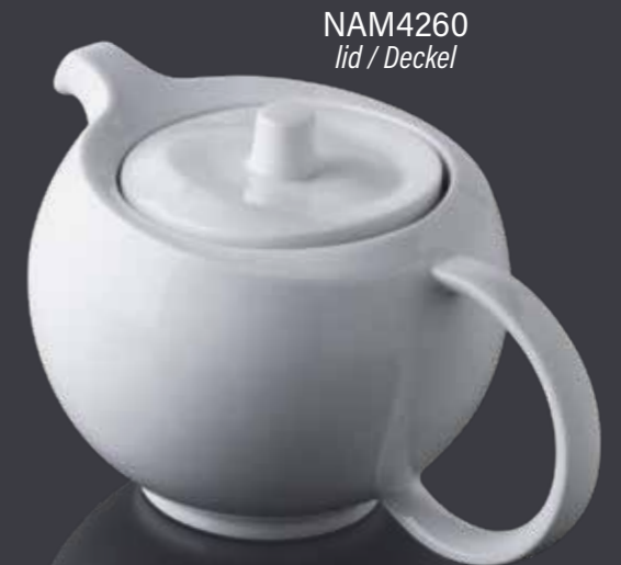
NAM4260 lid / Deckel