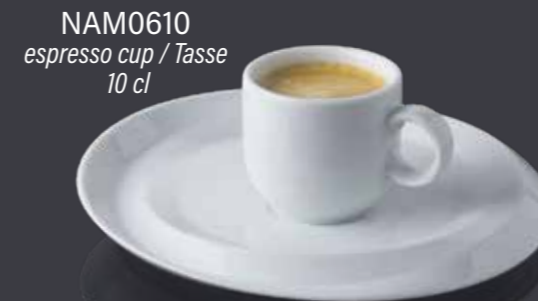
NAM0610 espresso cup / Tasse 10 cl