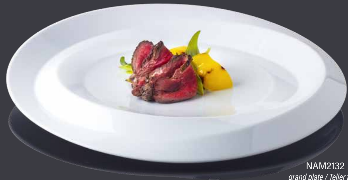
NAM2132 grand plate / Teller flach 32 cm