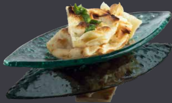
7-NAM BL-6902-18M glass leaf plate blue Glasplatte „Blatt“ blau 18 x 8 cm