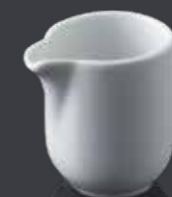
TIM3603 creamer / Giesser 3 cl