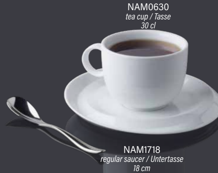
NAM0630 tea cup / Tasse 30 cl